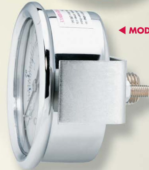
◀ MODEL 25TU